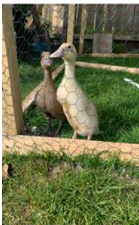
Our school ducks are getting big.